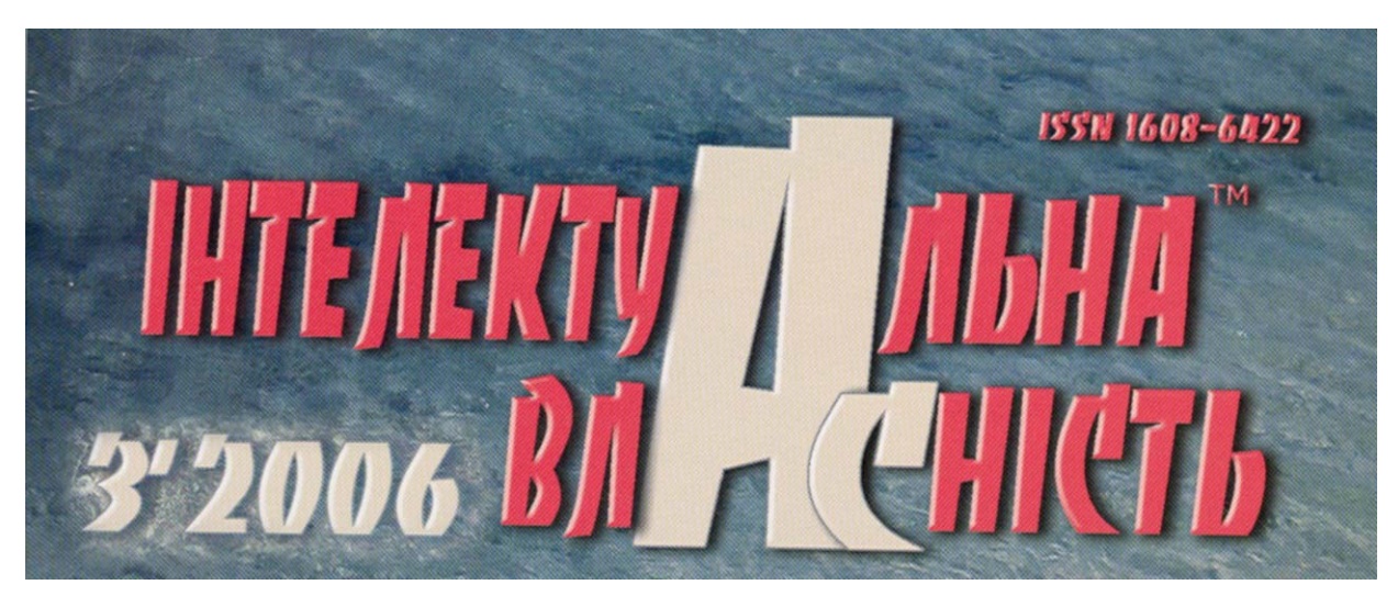
INTELEKTUALNA VLASNIST #03' 2006 (INTELLECTUAL PROPERTY) FACTS AND EVENTS