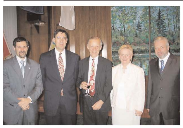
Meeting with representatives from Founder Countries of STCU