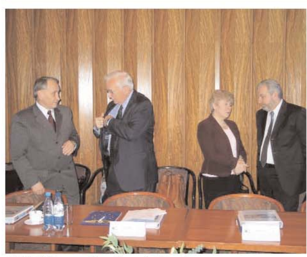
STCU Governing Board Meeting